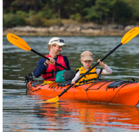
Kayakers on the Bay