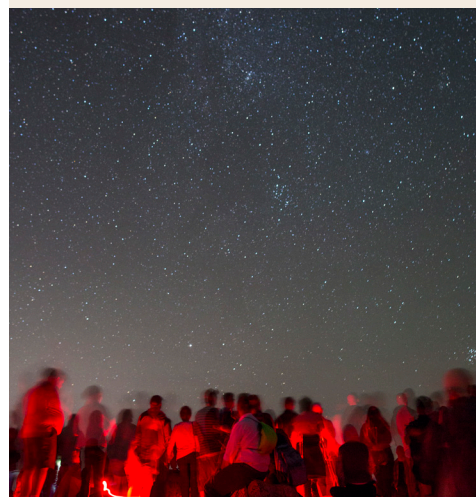
Acadia Night Sky Festival