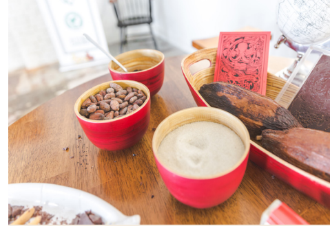
Bixby & Co. Chocolate