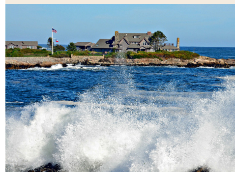
Walker's Point in Kennebunkport