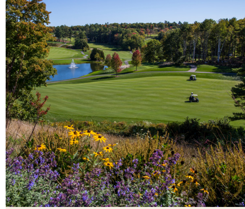
Boothbay Harbor Country Club