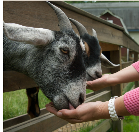
Boothbay Railway Museum