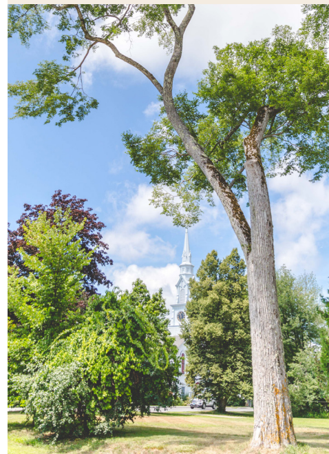
"Under the Elms and By the Sea"