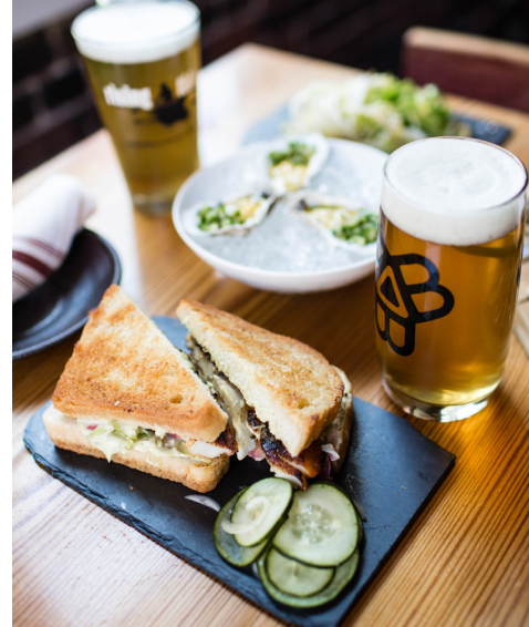
Lunch at Central Provisions