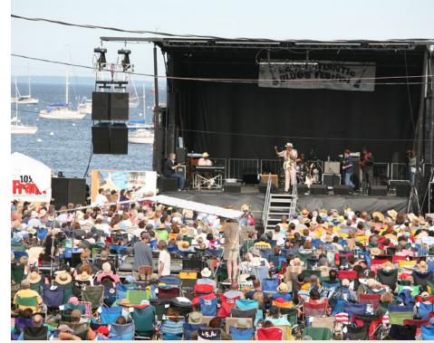
The North Atlantic Blues Festival