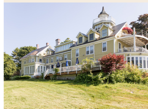
Captain A.V. Nickels Inn