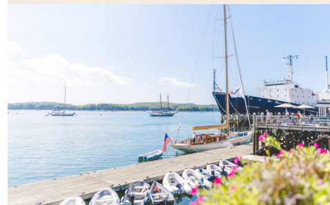
Maine Maritime Academy's Training Ship