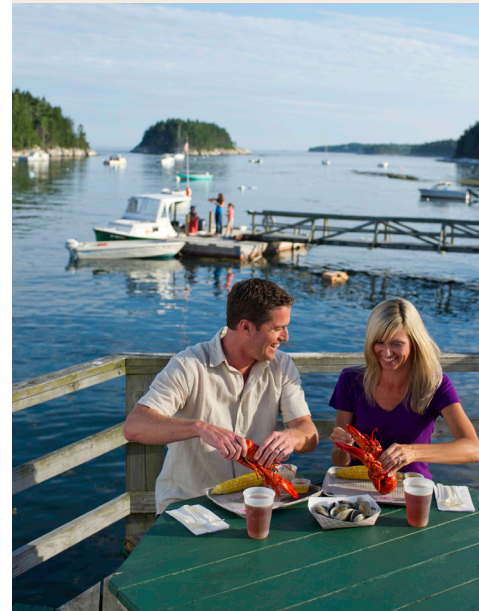
Lunch at Five Islands Lobster Co.