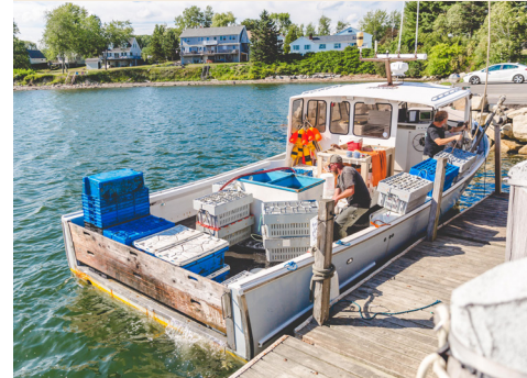
Fresh Lobster Delivery to Young's Lobster Pound