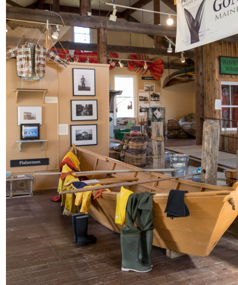
The Penobscot Marine Museum