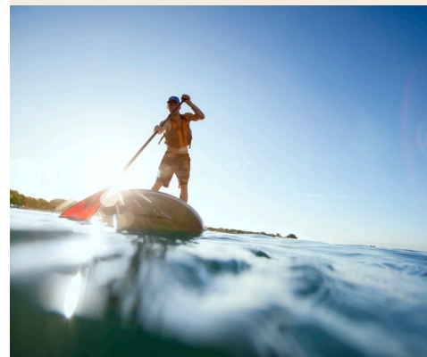
Paddleboarding in Freeport