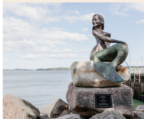
The Eastport Mermaid