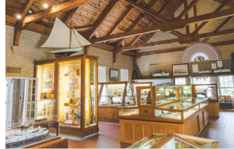
The Wilson Museum

CASTINE MAINE Under The Elms And By The Sea