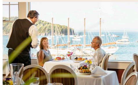
The Bar Harbor Inn and Spa