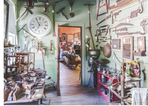
Bucksport Historical Society