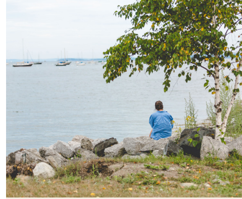
Relaxing along Belfast's Harbor Walk