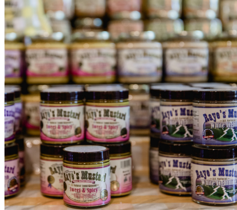
Raye's Mustard Mill and Museum